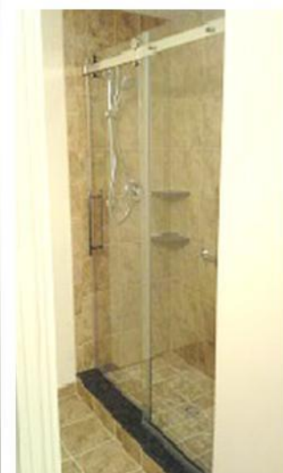
Custom Glass Doors