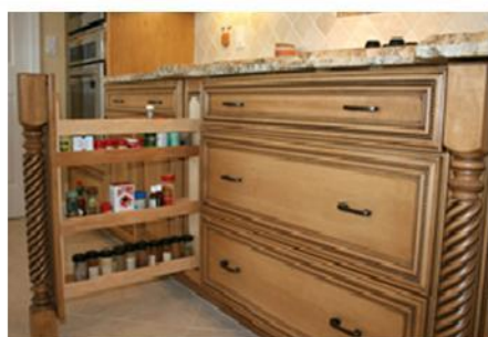
Pull Out Spice Rack