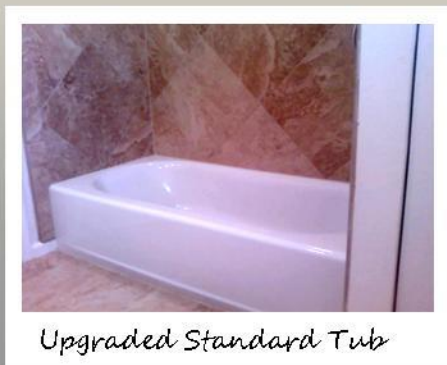
Upgraded Standard Tub