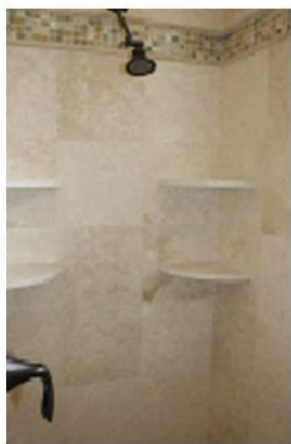
Built in Shelves