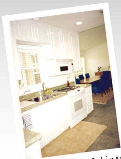
Ceiling Height Cabinets

There are many reasons to remodel your kitchen including: