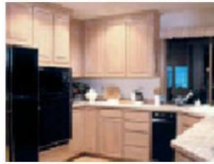
New Kitchen with Natural Light