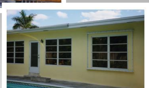
Addition—Blends right in!

Leading Edge Homes designs custom room additions including bedrooms, bathrooms, in-law suites, theaters, family rooms, and more! As a design-build company, Leading Edge Homes ensures that your addition will look like it has always been part of your home, without you needing to hire an architect. See what your addition will look like in 3-D and “walk through” the rooms before we even break ground. Contact us to see how we can help you add a bedroom, bathroom, in-law’s suite, or room for any purpose you want.