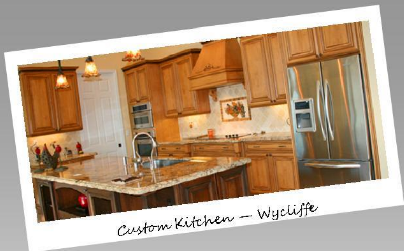
Custom Kitchen — Wycliffe